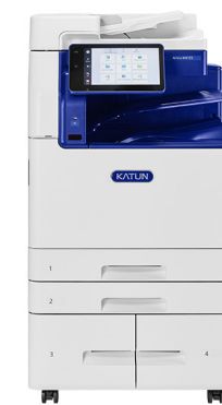
Equipped with Tandem Trays Module Standard (520 x 2 + 870 + 1,180 sheets)