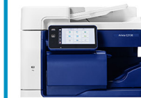
A2 INTERNAL FINISHER