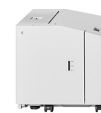
B2 HIGH-CAPACITY FEEDER 2,940 SHEETS