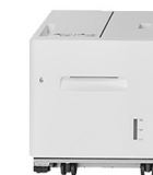
B1 HIGH-CAPACITY FEEDER 2,000 SHEETS