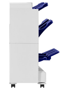
C4 FINISHER 1 INCLUDED BOOK MAKER AND HOLE PUNCH