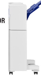
B4 FINISHER 1