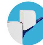
OPTIONAL BOOKLET MAKER FOR B4 FINISHER