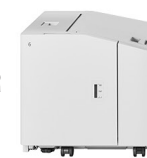
B2 HIGH-CAPACITY FEEDER 2,940 SHEETS