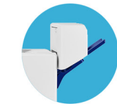
OPTIONAL BOOKLET MAKER FOR B4 FINISHER