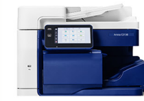
A2 INTERNAL FINISHER 4 OR