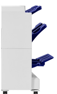
C4 FINISHER 13 INCLUDED BOOK MAKER AND HOLE PUNCH