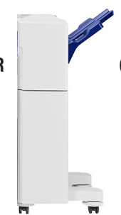
B4 FINISHER 2 OR