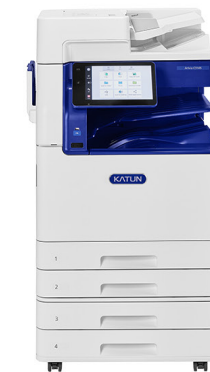
C3135/C3145 Equipped with 4 X 520 sheet paper trays standard