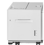
B1 HIGH-CAPACITY FEEDER 2,000 SHEETS