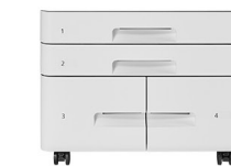
C4155/C4165 Equipped with Tandem Trays Module Standard (520 x 2 + 870 + 1,180 sheets)